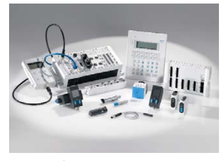
PLC's and I/O Devices PLC's, operator interfaces, sensors and I/O devices